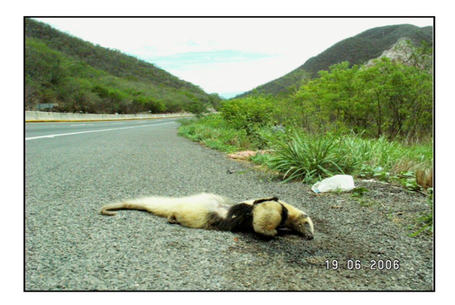
Figure 3. The Colima - Tecoman highway represents a formidable barrier for small and medium size mammals. Many individuals are killed every year along this highway.

The presence of T. mexicana in Colima is interesting and intriguing. It can best be explained by two different mutually exclusive hypotheses: The first is that the species has been historically present in Colima and was not recorded earlier; the second hypothesis is that the Collared Anteater has just recently dispersed into the state. We strongly support the idea that this is a new record for the species in Colima because the mammals of Colima are relatively well known, and the lack of records for such a relatively large and conspicuous species is unexpected, especially in such a populated area as the Colima – Tecoman highway (e.g. Baker and Phillips, 1965; Ceballos and Oliva, 2005; Nuñez Garduño, 2002). Additionally, T. mexicana was first recorded on the Pacific Slope of Mexico five decades ago in the Sierra Madre del Sur of Guerrero (Davis and Lukens, 1958; Leopold, 1959), where it is now apparently common. The species was unknown in Michoacan (Hall y Villa, 1949) until recently, when it was first recorded on the coast, relatively close to Colima (Sánchez H., et al. , 1999). Because there are no major barriers we expect that T. mexicana will continue dispersing north in the coming years.