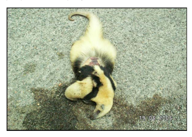
Figure 2. Collared anteater ( T. mexicana ) killed on the Colima – Tecoman highway.